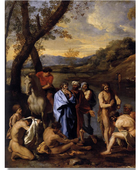
Nicolas Poussin: St. John the Baptist Baptizes the People

The True Light, Who gives light to everyone, was coming to the world.